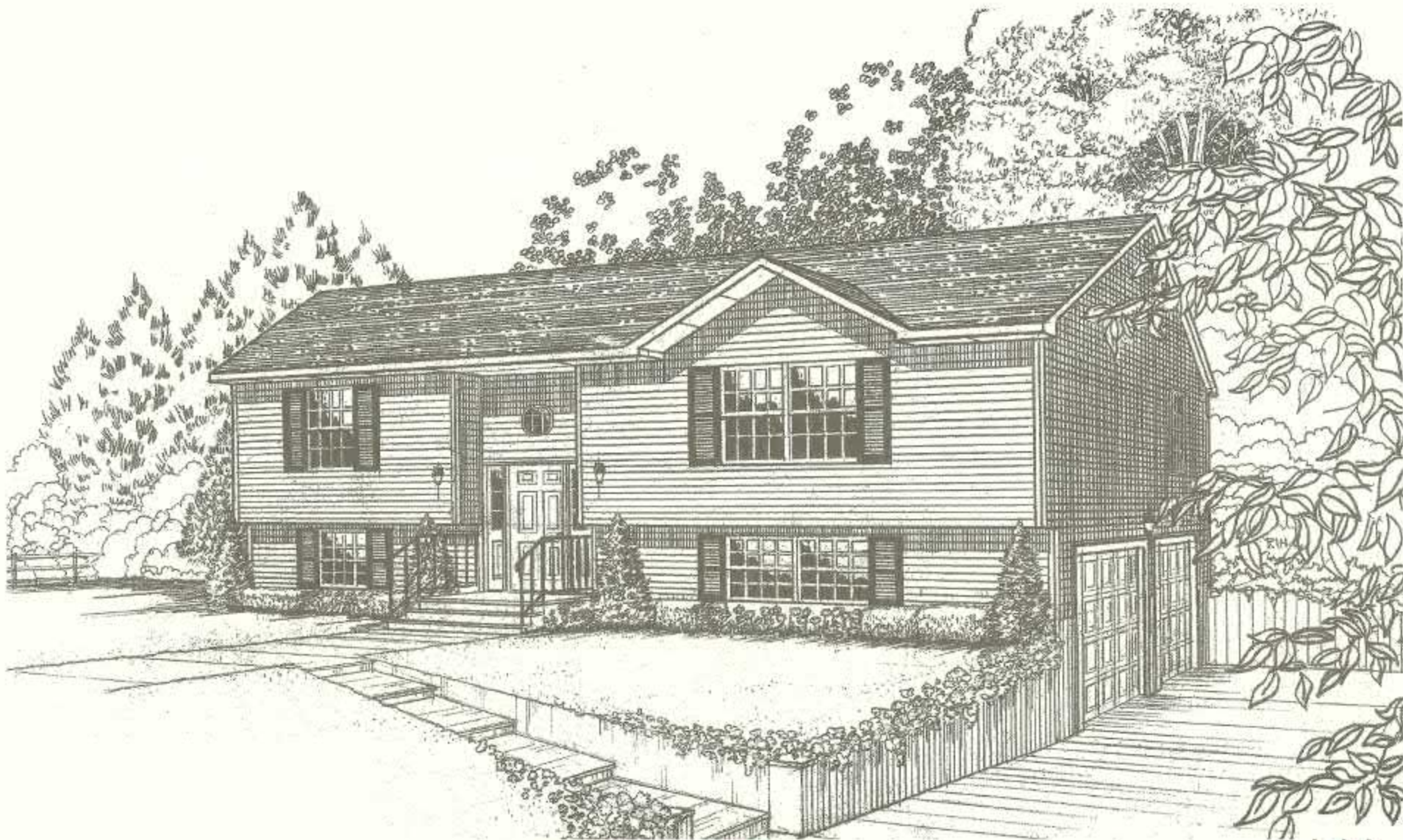
Shown with optional reverse gable, double front door sidelites, and octagon window.