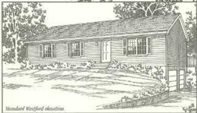
Standard Westford elevation.