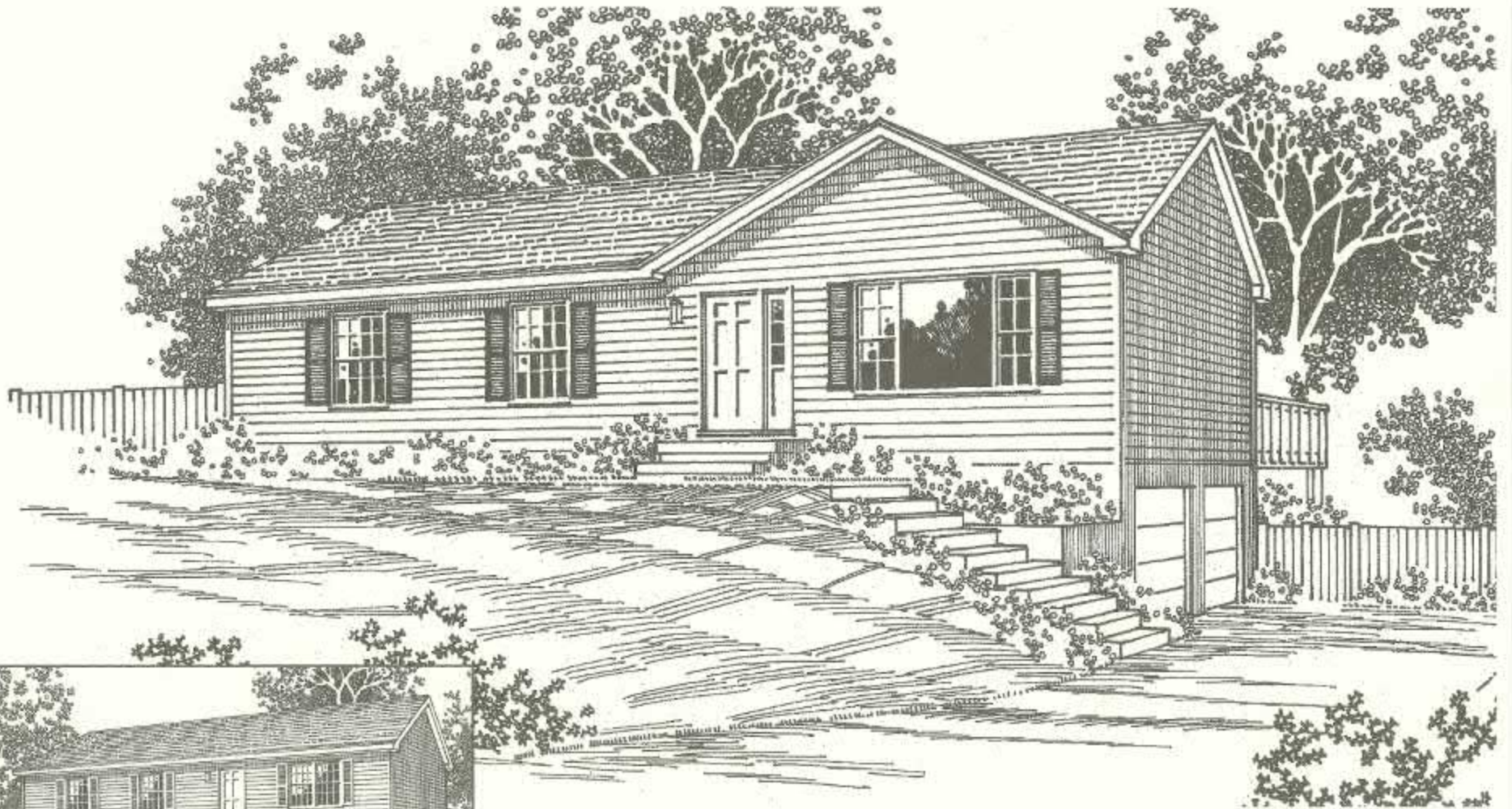
Shown with optional reverse gable, picture window and front door sidelite.