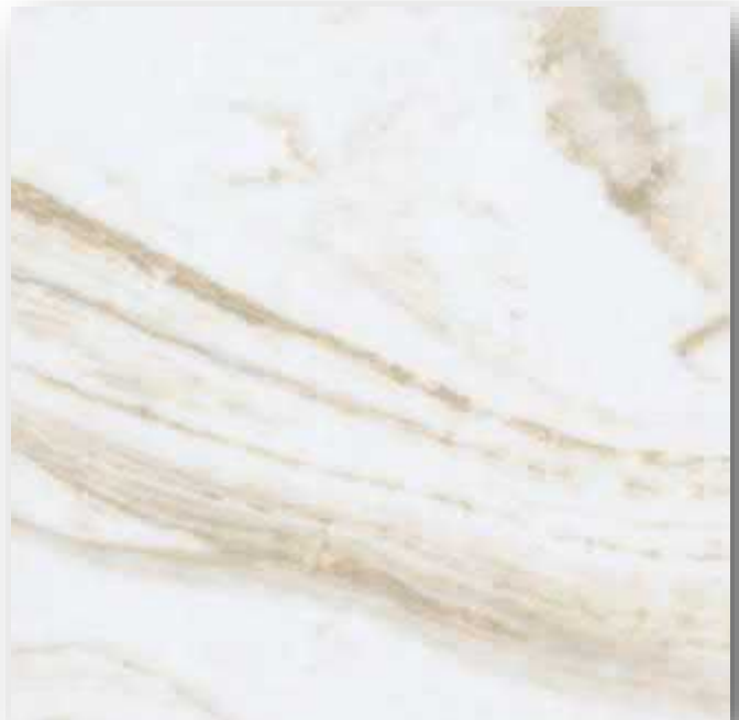
SANDBAR ON WHITE