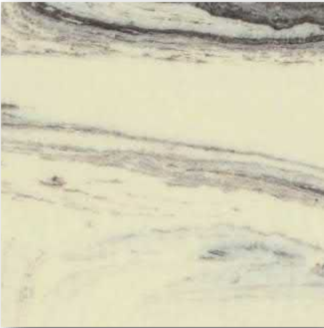
WALNUT BROWN ON BONE