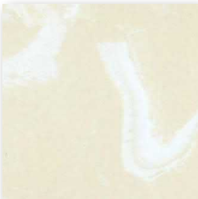
WHITE ON BONE