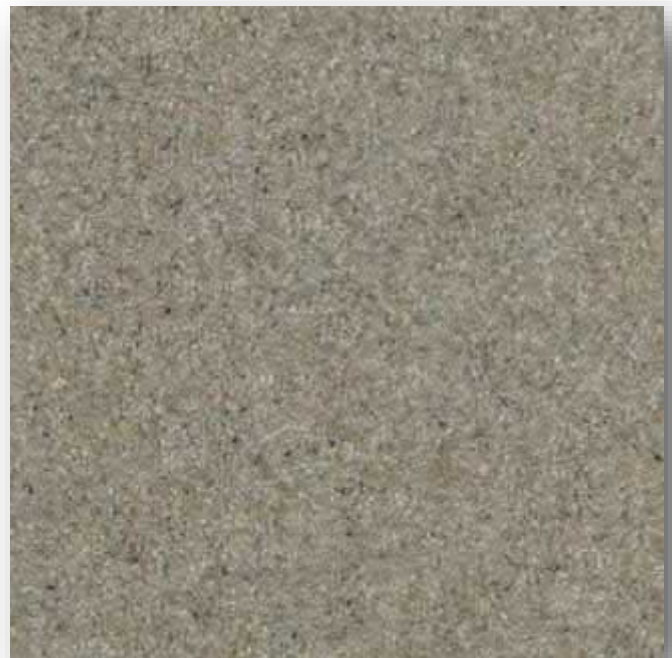
ENGLISH BROWN GRANITE