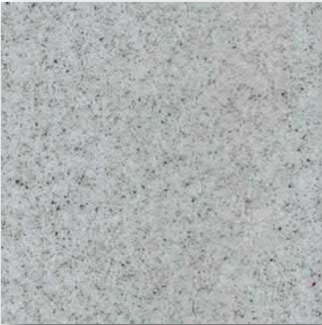
FASHION GRAY GRANITE