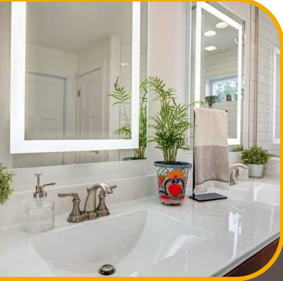
PICTURED: SOLID WHITE WITH WAVE BOWL