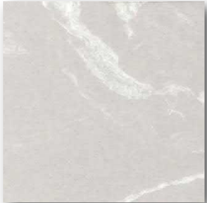
WHITE ON PALE GREY