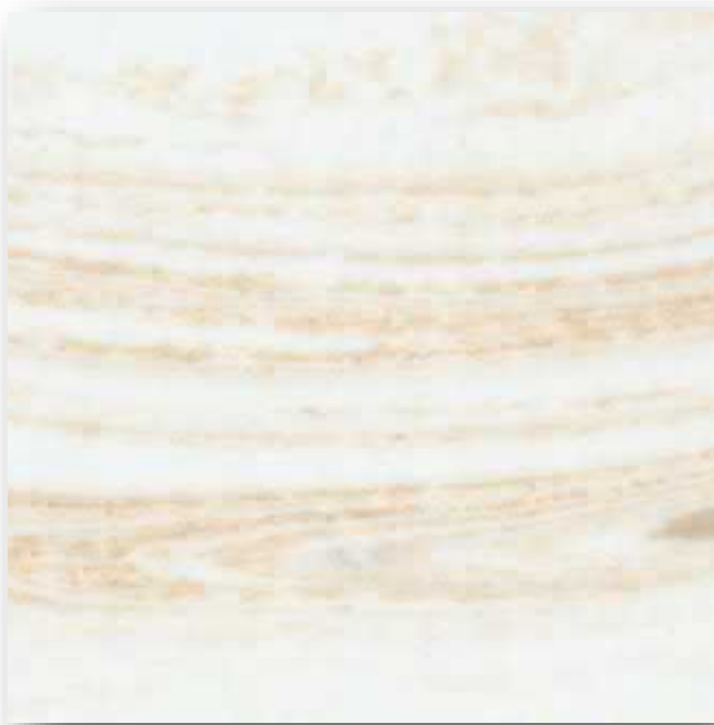
FAWN BEIGE ON WHITE