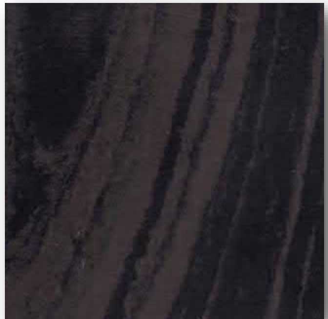
THUNDER GREY ON BLACK