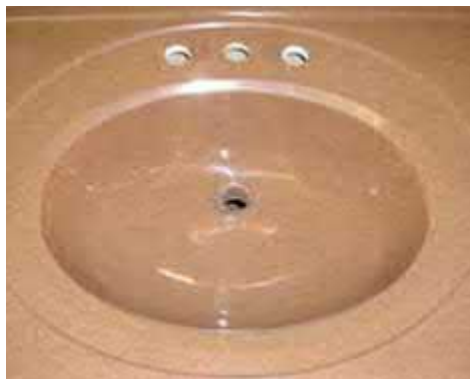
Recessed Oval (standard)

23" x 18-1/2" rim to rim 17-1/4" x 12-1/4" inside 6" deep Minimum 12-1/2" C/L Underneath measurement of all bowls are approximately 3/4" wider than inside NOT ADA COMPLIANT