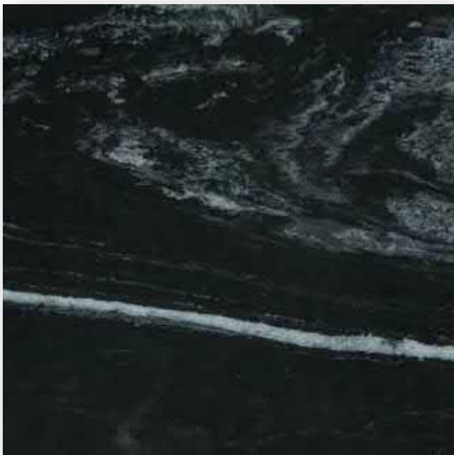
WHITE ON BLACK