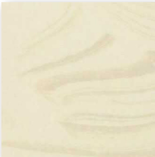
MUSHROOM ON MUSHROOM