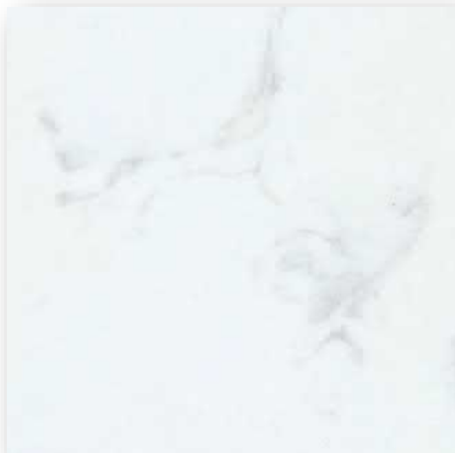
PALE GREY ON WHITE