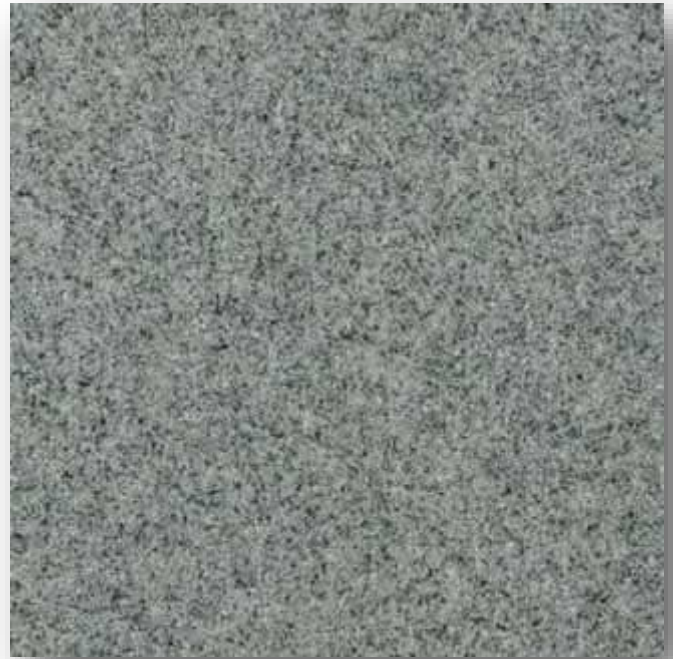
STEEL GRAY GRANITE