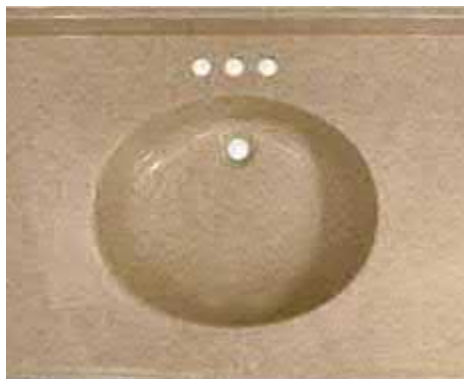
Flush Oval / Newport (standard)

21" x 16" rim to rim 15-1/2" x 10-1/4" inside 6" deep Minimum 11" C/L Underneath measurement of all bowls are approximately 3/4" wider than inside NOT ADA COMPLIANT Also available in 25" depth