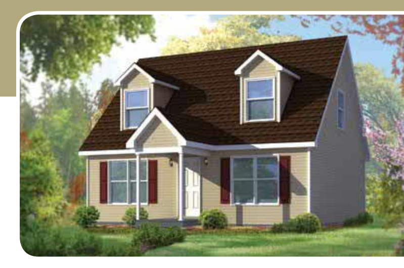
1st Floor = 825 Proposed 2nd Floor = 490